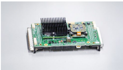
UAV flight controller.jpg

The intelligent charging solutions ensure an efficient, safe and reliable power supply – even under challenging operating conditions.