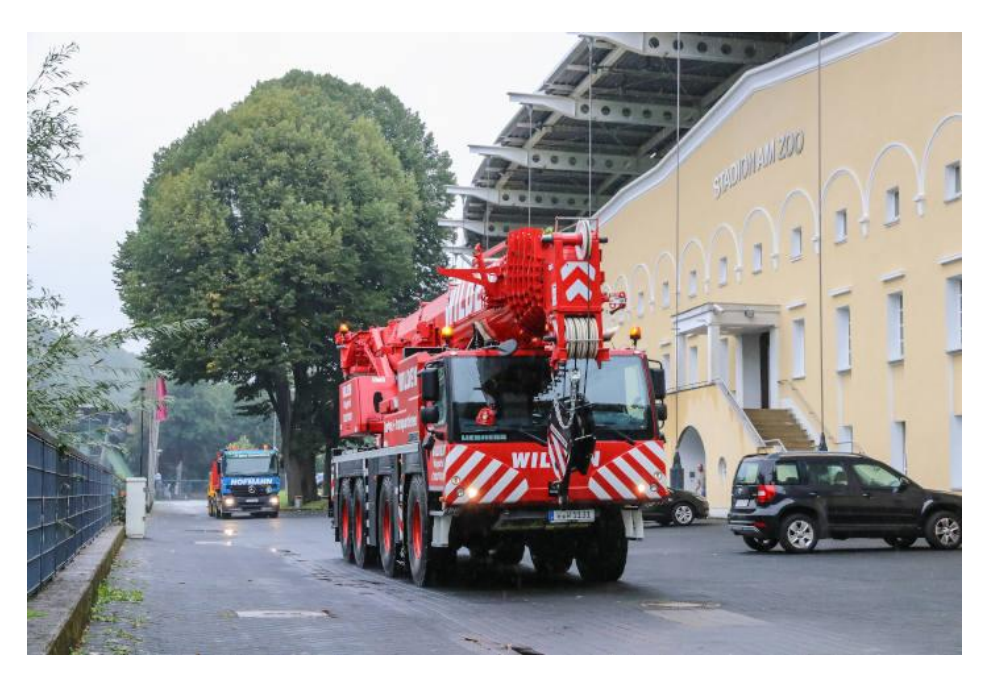
liebherr-wilden-ltm1090-4-2-stadion.jpg Sister company Hofmann delivers crane accessories to the site.