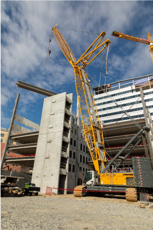
Caption: Structural Unlimited LLC's LR 1300.1 SX hoisting a precast double tee beam during the construction of the new CHKD Mental Healthcare facility parking garage

Filename: Liebherr_LR1300 Crawler_CHKD_vertical working.jpg