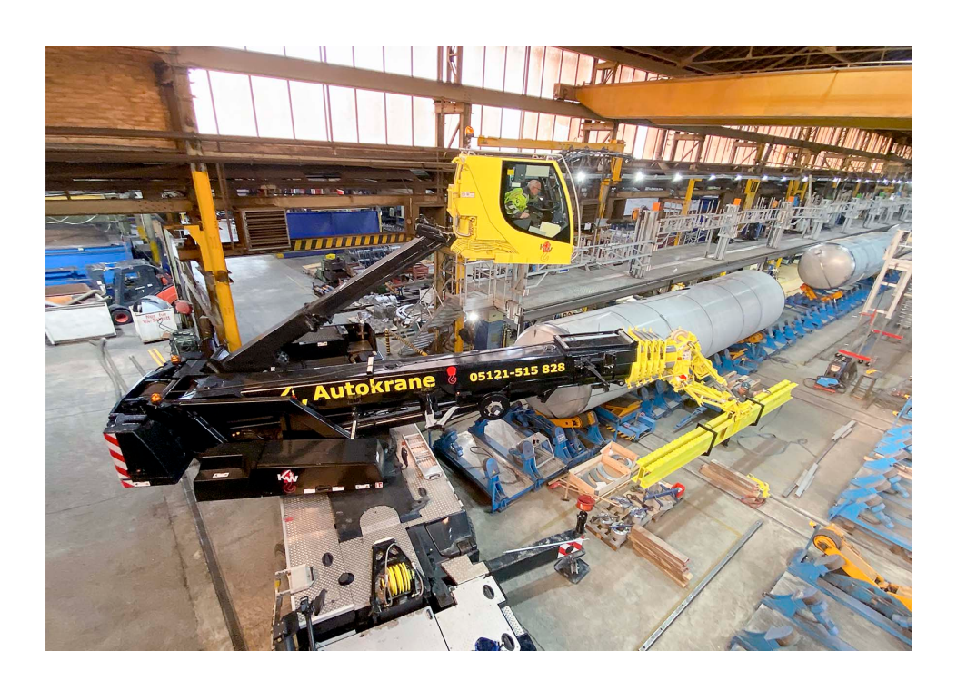
liebherr-ltc1050-3-1-k&w-motiv4.jpg A clear view – the telescoping elevating cab provides the crane operator with a great view of what is happening at all times.