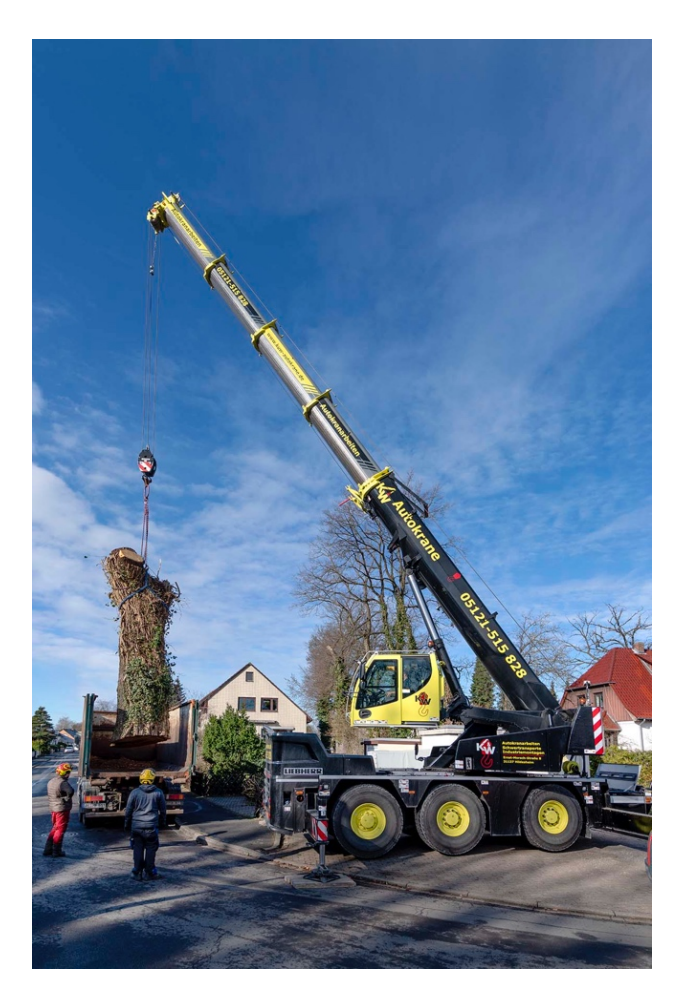
liebherr-ltc1050-3-1-k&w-motiv5.jpg Gardening – the compact crane even only requires a small parking bay to remove a six tonne oak trunk.