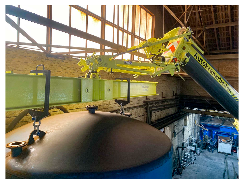
liebherr-ltc1050-3-1-k&w-motiv3.jpg Variable – the angle of the erection jib can be adjusted to the specific requirements. This makes hoisting heights up to just below the building roof or other limiting levels possible.