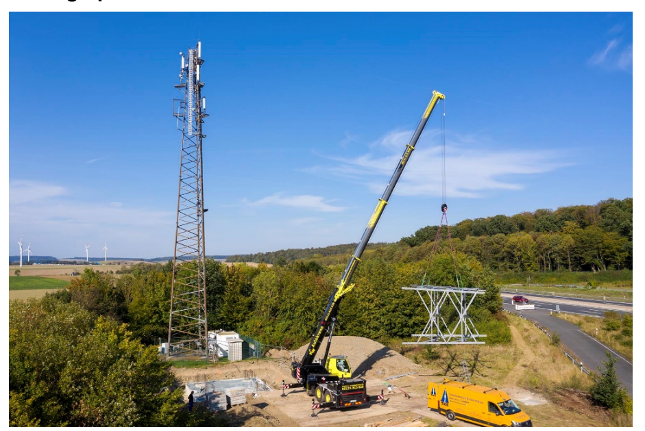
liebherr-ltc1050-3-1-k&w-motiv1.jpg Suitable for universal use – the LTC 1050-3.1 from K&W helps out with assembly work on a radio mast.