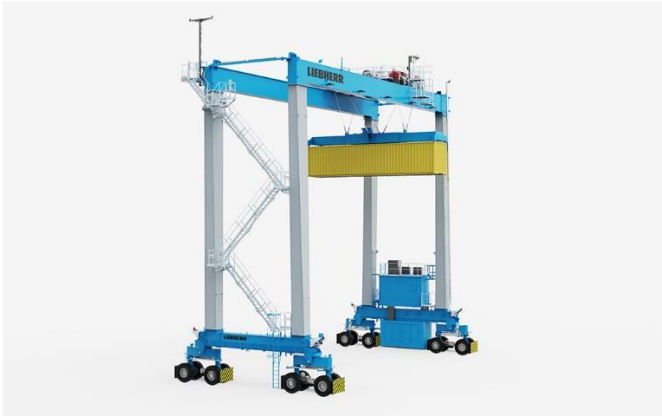
Liebherr_auto_rtg.jpg A cabinless, automated RTG crane