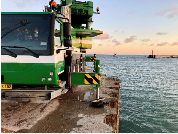
liebherr-ltm1100-4-2-kristensen-2.jpg VarioBase® enabled Danish company Tage Kristensen to complete the job safely.