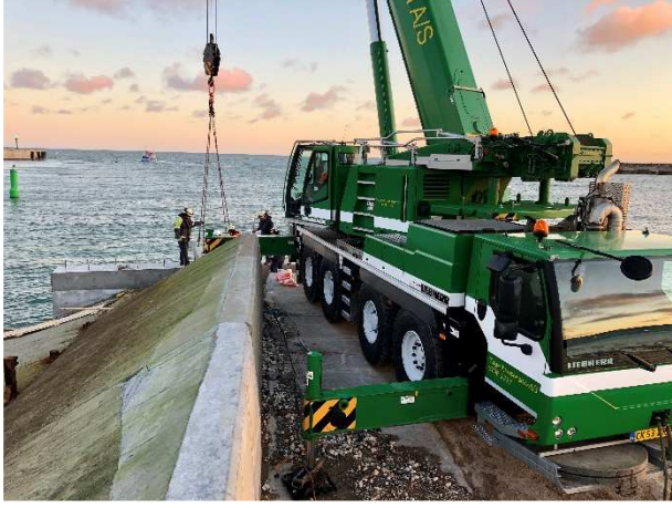
liebherr-ltm1100-4-2-kristensen.jpg The LTM 1100-4.2 had to position a 7 tonne concrete component outside the pier.