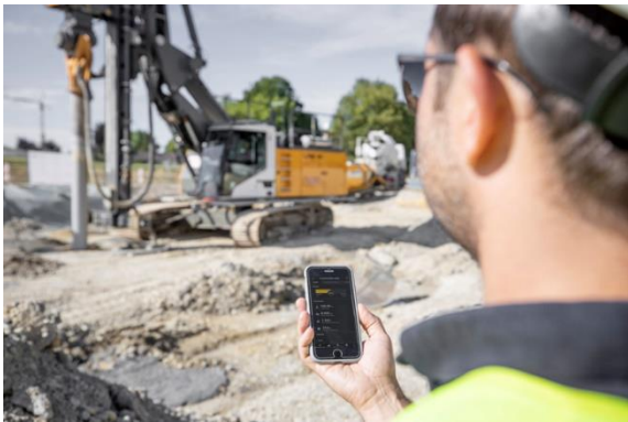
liebherr-myjobsite-03.jpg Maintain an overview of jobsites and machines.