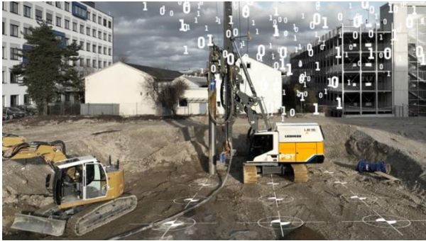
liebherr-myjobsite-02.jpg Different data sources are pooled in one platform.