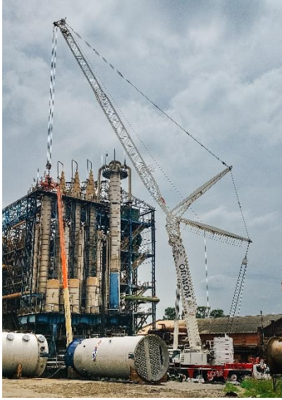
liebherr-orimom-ltm-1400-7.1.jpg The LTM 1400-7.1 from Orimom during an industrial assembly.