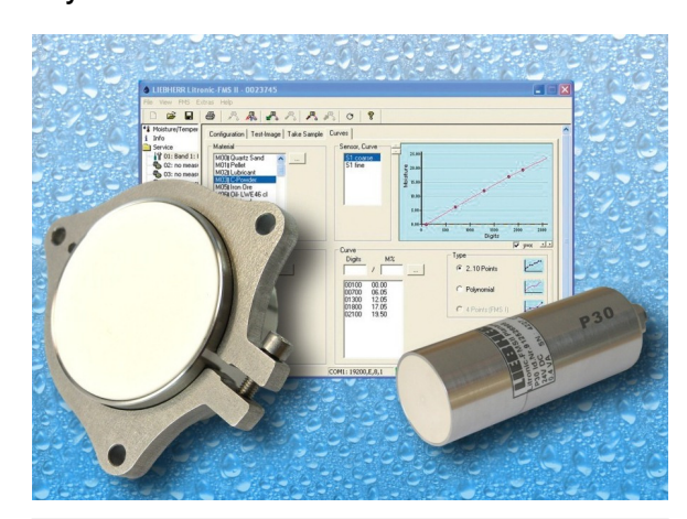
Litronic-FMS II: Sensor, electronic module and software.