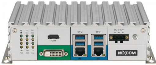
Fig. 1 Litronic RMH evaluation and interchange unit