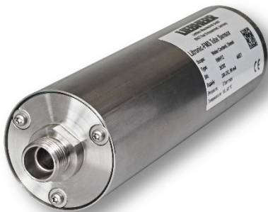
Fig. 3 Tube sensor