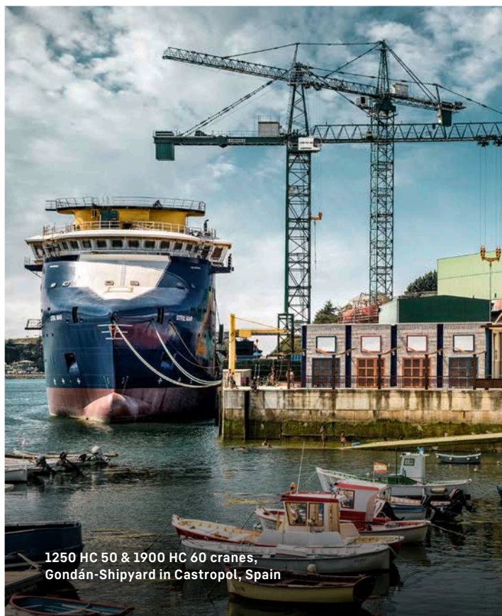
1250 HC 50 & 1900 HC 60 cranes, Gondán-Shipyard in Castropol, Spain

...m quality product ...ile machinery ...ed for extreme ...ions