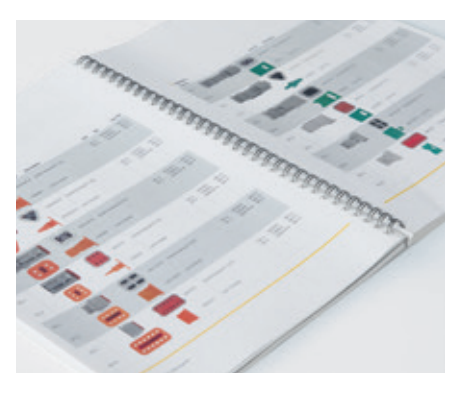
Straightforward – Step by Step All components and usual working processes are clearly described in the accompanying documentation. The comprehensive handbook combines working steps and the corresponding tools and components. This significantly simplifies the use on site.

All modules are sufficiently equipped and sorted according to component - from plug housing to wiring pins. Common plugs are already pre-sorted in sets.