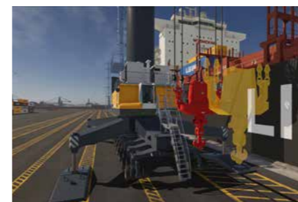
Luffing gear training