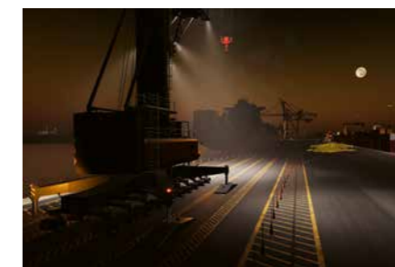
Different weather and lighting conditions