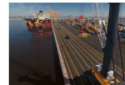
Travelling through a defined training course