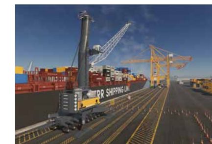
Lifting loads through narrow passages